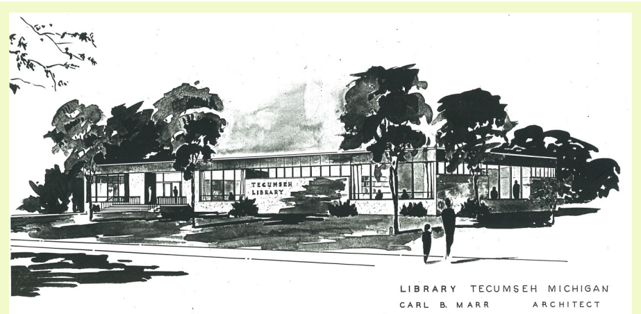
Architect's rendering of Tecumseh District Library's current building 1960

Our Library Board, our Friends group, our library staff and various directors, and our supportive patrons have each made substantial contributions to the legacy of Tecumseh District Library. It truly is a cornerstone of our community.