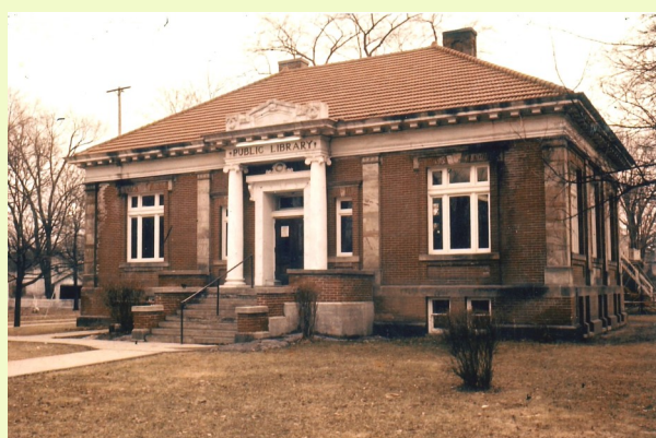
Tecumseh Public Library Carnegie Building 1960

In 1903, the School Board received funding from the Carnegie Foundation for a new library building to be built on Chicago Boulevard. This Carnegie Building was dedicated February 10, 1905 as Tecumseh's Public Library. The library shelves held 8,808 volumes. State aid was the library's major source of funding until a millage approved by voters in 1945 provided operating funds. Lenawee County received two more of the 5,000 Carnegie libraries built in the U.S. One was built in Adrian between 1907 and 1909, and the third was built of field stone in Hudson and is still being used as a library today.