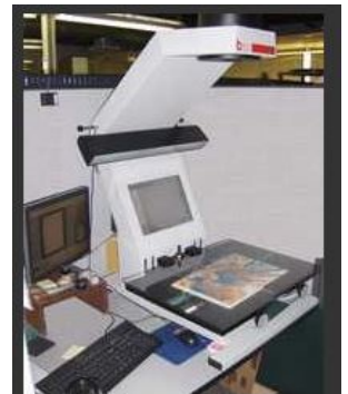
One of the machines used to digitize the yearbooks.

If you have any questions, please call the Library at (517) 423-2238.